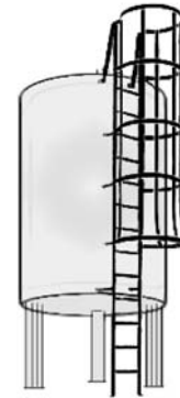
Ladder with Cage

OSHA requires cages for ladders 20 ft and above.