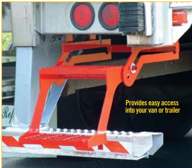
Provides easy access into your van or trailer